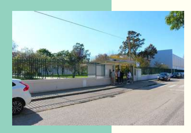
AGRUPAMENTO DE ESCOLAS DE ESGUEIRA Adress: Rua Pedro Vaz de Eça, 3804-506 Aveiro