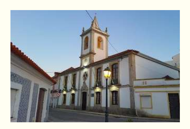
JUNTA DE FREGUESIA DE ESGUEIRA Adress: Rua Bento Moura, 34, 3800-114 Aveiro